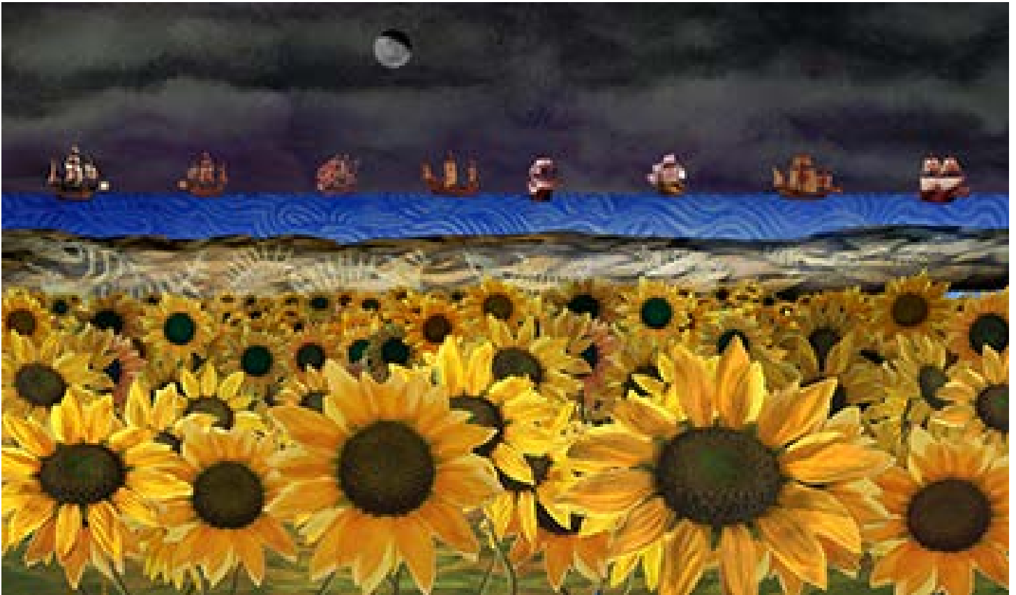
BANCO TAÍNO 2018